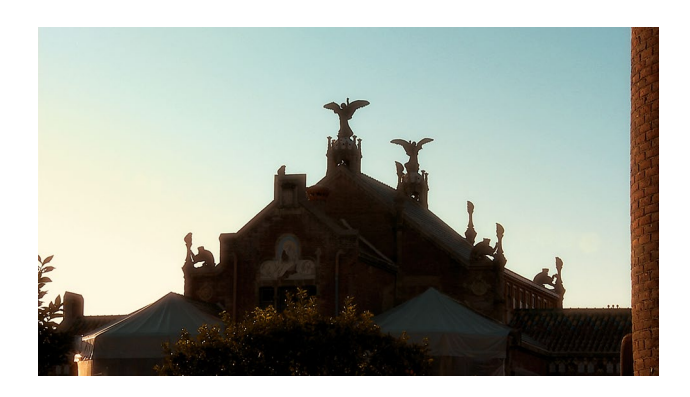
Fig. 1 The beauty (and not only the devil) in the details