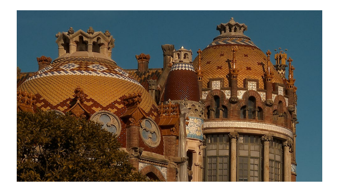
Fig. 2 Architectural details of the pavilions of the Hospital de la Santa Creu i Sant Pau.

because of globalization [5]. While economies of scale seem to favour "hospital factories", events like the Covid-19 infection risk compromising their ability to function, and could ultimately cause large economic losses, by making it impossible to differentially modulate the provision of care when limiting human-to-human contact is necessary.