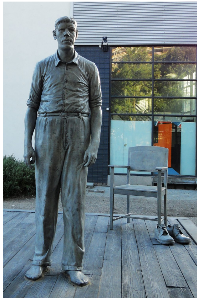
Fig. 1 Photograph of the life-size bronze statue and bronze shoe replicas of Rigardus Rijnhout (1922–1959) in Rotterdam, the Netherlands.

At least three other bronze (life-size) statues of once famous acromegalic giants exist. In this journal there was already a report on the bronze statue of Robert Pershing Wadlow (2.72 m., 1918–1940) in Alton, Illinois, USA, which was created in 1985 by the American sculpturer Edward Engelhardt Giberson (1948) [3]. A bronze life-size statue of Fermin Arrudi Urieta (223.5 cm, 1870–1913, “el Gigante de Sallent”, “the Sallent giant”, “the Aragonese giant”) [4, 5] was created in 2014 by the Spanish sculpturer Jaqués Pedro J Larraz and can be found in Sallent de Gállego, Spain. A bronze life-size statue of Jose Calderon Torres (235 cm, 1915–1973, “the Tampico Giant”) [6], seated on a bronze bench was created in 1975 by the Mexican sculpturer Víctor Hugo Yáñez Piña (1967) and named “Peptito el Terrestre”. It can be found in Tampico, Colonia Arenal, Mexico.