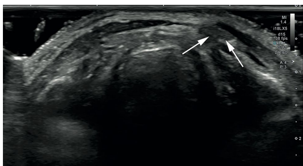
Fig. 1 Transverse gray-scale sonogram of an 80 year old male cadaver showing a left-sided PL (arrows)