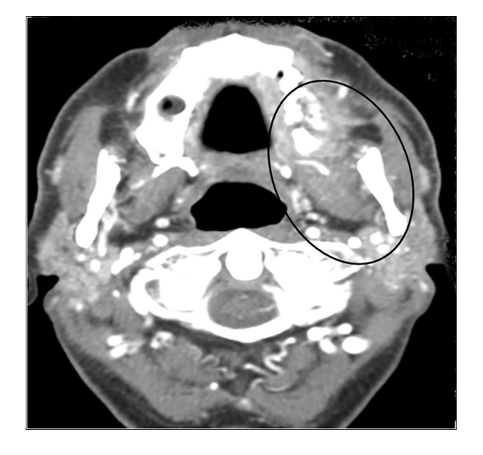
Fig. 2 CT scan of the skull image showing an inflammatory morphological pattern of the left maxillary bone with bone erosion, in communication with the oral cavity. The inflammatory lesion involved the contiguous soft tissues too

A CT scan of the skull performed 1 month later, showed an inflammatory morphological pattern of the left maxillary bone, that involved soft tissues, with bone erosion, in communication with the oral cavity (Fig. 2). A further radiological evaluation concluded that maxilla and mandibular bone were both compromised and that the alterations observed were compatible with a ONJ. After a multidisciplinary meeting, including a neuroradiologist, an odontologist, and a maxilla-facial surgeon, sorafenib was discontinued and antibiotic therapy was administered to perform a surgical toilette. In March 2017, the patient underwent surgical