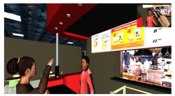
Fig. 4 Environment 3

When the boat was ready, the boy told a man to lead the elephant down into it. The elephant was very heavy, and the water came up very high along the boat's sides. Cao Chung made a mark along the water line. After that the man