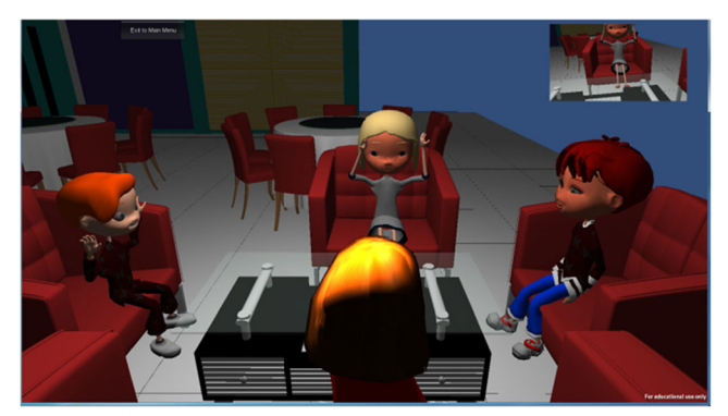
Fig. 5 Environment 4

transported the elephant onto the bank. Cao Chong then told the men to put heavy stones into the boat until the water again came up to the line. Cao Chung then told the men to take the stones off the boat and weigh them one by one. He wrote down the weight of each stone and then added up all the weights. In this way he determined the weight of the elephant.