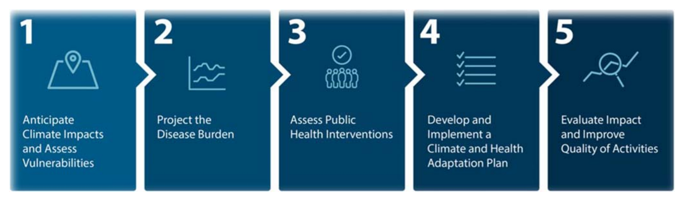
Fig. 1 The five-step BRACE framework

Small grants from CDC-funded CRSCI states to local jurisdictions have been another effective method of supporting local climate and health adaptation efforts. While not a requirement, several states receiving CDC funding have distributed competitive sub-grants to counties and cities within their states. These grants facilitate capacity building, forging partnerships with entities outside of health departments, incorporating climate change information into existing programs, and developing adaptation plans, while streamlining collaboration across multiple levels of government. Surveys of grant recipients found increases in knowledge, engagement with diverse