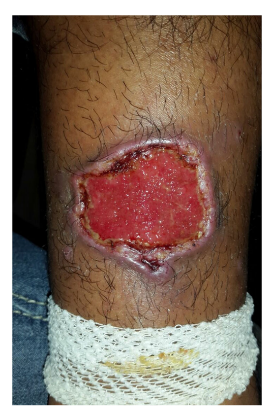
Fig. 2 Cutaneous leishmaniasis: arm ulcer with typical appearance in a patient with L. panamensis