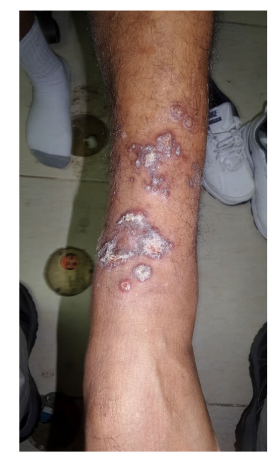
Fig. 3 Cutaneous leishmaniasis: L arm revealing diffuse CL disease