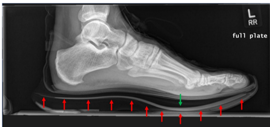
Fig. 1 Lateral X-ray of a runner's left foot in a carbon-plated running shoe. Red arrows outline the embedded plate. The green arrow shows the fulcrum point of the plate. Note the relation of the curvature of the plate to the metatarsal locations (metatarsal phalangeal joints)