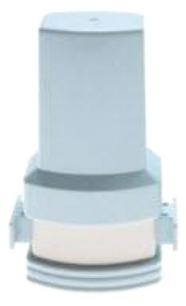
Fig. 1 Image of (a) Breezhaler<sup>®</sup> and (b) Aerolizer<sup>®</sup>

generating the necessary inspiratory flow to achieve an efficient drug delivery from DPIs [32, 33].