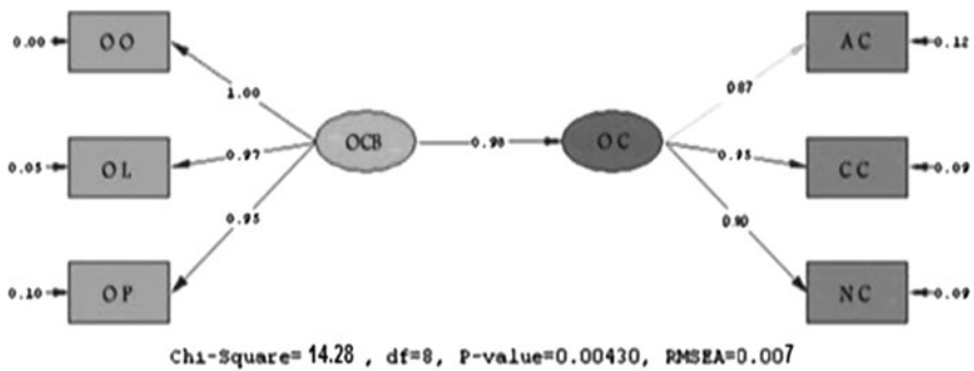
Fig. 3 LISREL general model designed to explain the theoretical framework of the research

with this model. In Fig. 3, the final model developed using LISREL software is presented which is the final result of this research process.