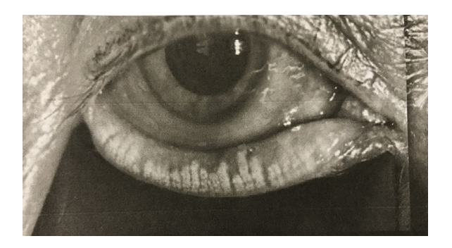
Fig. 3 Meibography showing Meibomian gland dysfunction (MGD); note darker areas on the lower lid signifying the loss.