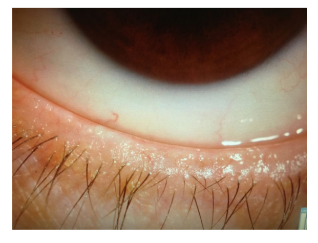
Fig. 2 Anterior blepharitis showing keratinization.