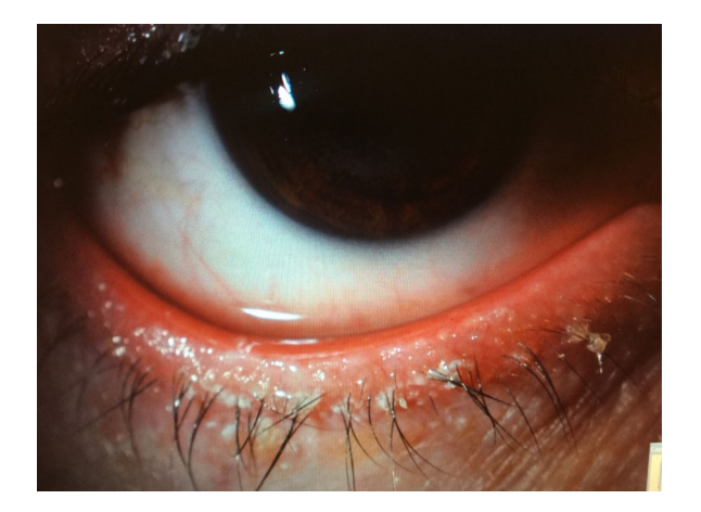
Fig. 1 Anterior blepharitis showing scurf.

This article is based on previously conducted studies and does not contain any studies with human participants or animals performed by any of the authors.