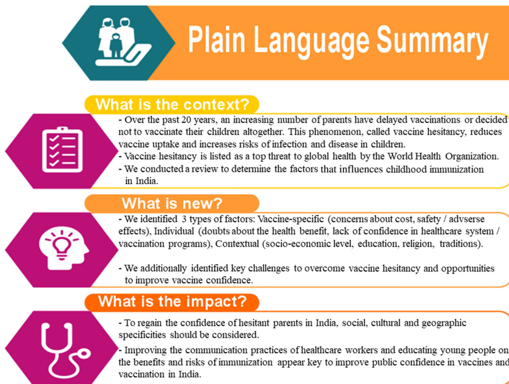
Fig. 1 Plain language summary

Keywords: Immunisation; India; Vaccination; Vaccine confidence; Vaccine hesitancy