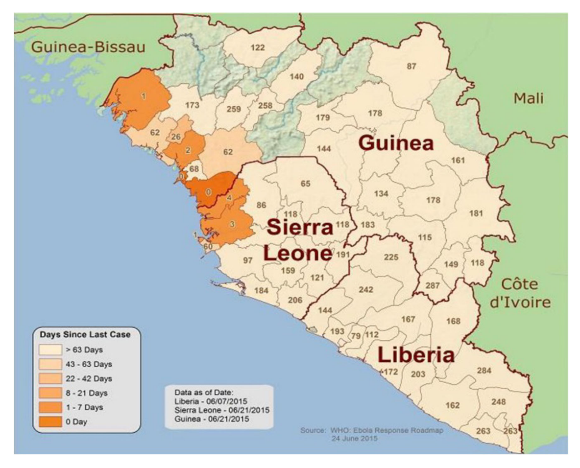
Fig. 2 Map of the West African region showing the number of days passed since the last case reported to the World Health Organization. Last updated 24 June 2015. Reprinted from the Ebola Response Roadmap. Map of

animals [30, 32, 34], and Marburg virus has been isolated from Egyptian fruit bats ( Rousettus aegyptiacus ) [29].