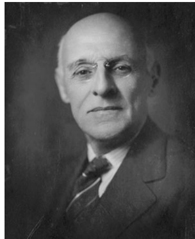
Fig. 1 Abraham Flexner (1886–1959)

This article is not a historical review of the contributions of these two outstanding individuals; it would be pretentious for me to presume that I have the skills to write