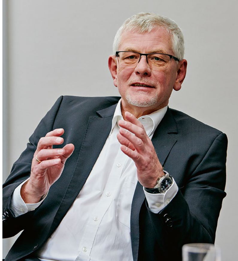
"The lesson for the powertrain developers is to cover all the options and to make all of them market-ready," says Goericke