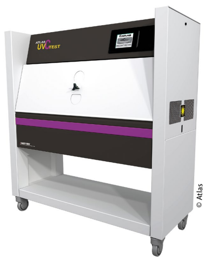
With irradiation centered on 254 nm wavelength, the influence of disinfection measures can be simulated by UV-C radiation.

While UV-C disinfection has traditionally been applied under relatively controlled circumstances using specially designed equipment by trained users and in limited (but effective) dosages, essentially anyone – even with little knowledge of the potential hazards – can now expose materials to UV-C. Due to the large num-