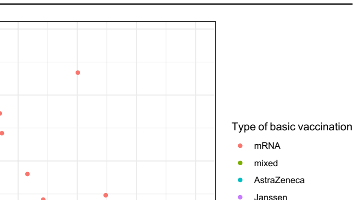
Fig. 1 Scatter-plot on the association between CD4 cell nadir and concentrations of anti-SARS-CoV-2-antibodies after standard vaccination. The solid line indicates a median regression line for antibody- concentrations by CD4 cell nadir