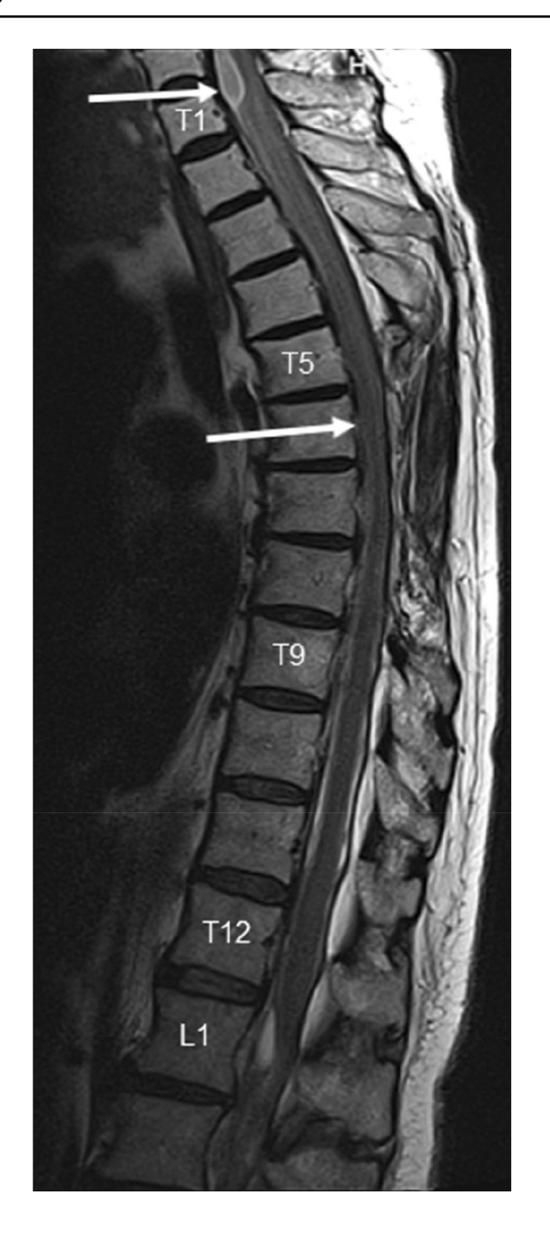
Fig. 3 MRI T2-weighted STIR-sagittal view of spine board strict adhesion of the spinal cord to the dura mater in the thoracic spine with complete reduction of front fluid collection of the thecal sac. Numerous adhesions of pia mater with cystic lesions in the front part of the spinal canal at the cervicothoracic and thoracolumbar junction

The pathology of adhesive arachnoiditis arises from the fibrous invasion of the pia mater, caused by its inflammation resulting in production of fibrous tissue and adhesions, as well as a strict adherence of spinal roots to one another and/ or to the thecal sac [2]. As the arachnoid has no vasculature or innervation, the healing process is very difficult, similar to that of other serous membranes like peritoneum or pleura. Constant circulation of cerebrospinal fluid makes it even