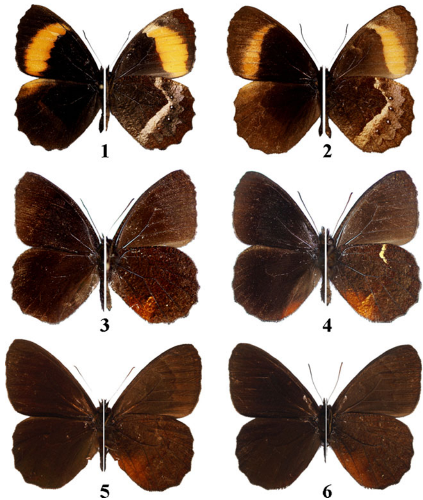
Fig 2 Male adults of Pedaliodes ornata , Pedaliodes minabilis , and Pedaliodes montagna . 1. Pedaliodes ornata haroldboxi , Pico Tonojo, 2. Pedaliodes ornata ornata , Monte Zerpa, 3. Pedaliodes minabilis , Monte Zerpa, 4. Pedaliodes minabilis , El Baho (form luteocosta ), 5. Pedaliodes montagna , Monte Zerpa, 6. Pedaliodes montagna , El Baho.

albocincta , Pedaliodes proerna , Pedaliodes japhleta Butler, and Corades pannonia Hewitson were collected exclusively in hand nets at 2,300–2,400 m and one, Manerebia francisciae (Adams & Bernard), at 2,550 m asl. In Monte Zerpa, 22 species were also collected on baits along the transect (see Online supplementary material ). Three species, Lymanopoda marianna Staudinger, Steromapedaliodes albonotata (Godman), and Cheimas opalinus (Staudinger), were caught in hand nets at 3,100 m asl. The only species reported in Monte Zerpa and not found in El Baho was P. ornata . Its absence is not an artifact of the sampling method used, as the elevation belt where it occurs (2,400–2,900 m asl) was extensively sampled in El Baho with both baited traps and hand nets before and after this study during different seasons of the year. Sørensen similarity index between El Baho and Monte Zerpa is 0.74 at the species level for trapped species and 0.96 when species collected with hand nets were included. At the subspecies level, the Sørensen similarity index is 0.55. The latter lower value reflects a wide scale differentiation of the Pronophilina of the CM at high elevations (above 2,800 m asl), which has led to the evolution of several