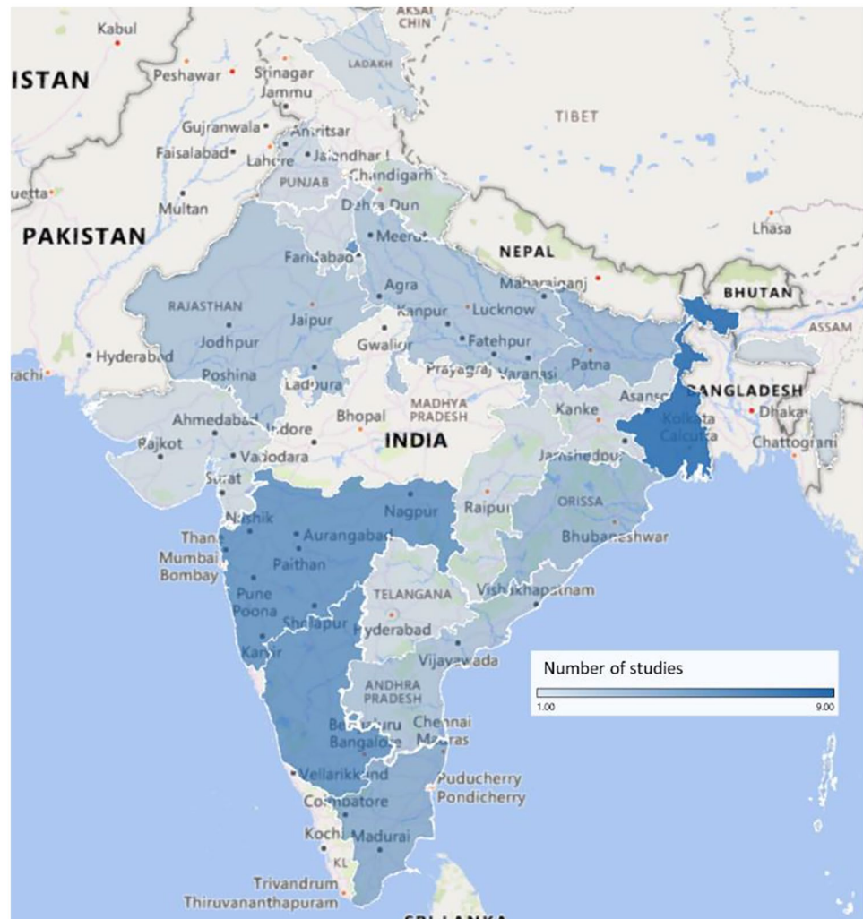
Fig. 2 Distribution of studies exploring food insecurity in India

condition. Responses to these questions are scored so that “never” receives a score of 0, “rarely” is scored 1, “sometimes” is scored 2, and “often” is scored 3, so that when summed, the lowest possible score is 0 and the highest is 27. A higher score represents greater food insecurity, with continuous scores typically divided into four categories, representing food-secure and mildly, moderately, and severely food-insecure households according to the scheme recommended by the HFIAS Indicator Guide [21]. The scale is based on a household’s experience of problems regarding access to food and represents three aspects of food insecurity found to be universal across cultures [22–24]. This scale measures feelings of uncertainty or anxiety about household food supplies, perceptions that household food is of insufficient quality, and insufficient food intake [21]. The questions asked in the HFIAS allow households to assign a score along a continuum of severity, from food secure to food insecure. Food insecurity measured via the HFIAS ranged from 77.2% in a population of 250 women who resided in an urban area in South Delhi [25] to 8.7% in Indian children [26].