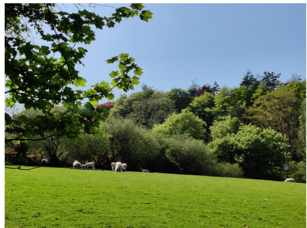
Fig. 1 Example of offsetting mitigation measure: planting hedgerows into sheep-grazed pasture in southwest England. Apart from GHG mitigation potential, through SOC sequestration, establishing hedgerows provides a range of co-benefits to livestock and the landscape. Trees can boost production, improve animal health and welfare, and provide wider environmental benefits (see Section 3.7).

Mitigation measures for delivering the UK Government's net-zero target by 2050 must consider both the economic (e.g., food production and reliance on imports) and environmental sustainability of production systems going forward (CIEL 2022). Furthermore, the NFU highlighted the fact that the transition of agriculture to net-zero GHGs must ensure the economic, environmental, and social benefits of farming, such as supporting rural workforces and delivery of nutritious produce, are protected (NFU 2021a). Environmental scientists and engineers, social scientists, nutritional scientists, and economists are therefore tasked to seek ways to increase productivity while at the same time reducing