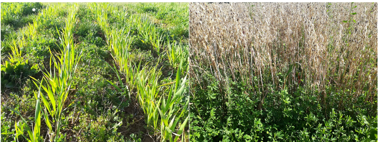
Fig. 1 Cereals on legume living mulch. Left: winter wheat in lucerne living mulch (22/03/2022). Right: oats on lucerne living mulch (20/07/2021).

Depending on the authors, the crops, and the cropping techniques, different definitions were used for “living mulch” (see Feil and Liedgens 2001 for an overview). A very general