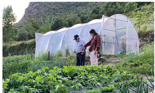
Fig. 1 A farmer from the study site explains the different crops he grows.

For this research, we adapted the LICCI data collection protocols (see Labeyrie et al. 2020; Reyes-García et al. 2020 for more details) that are specifically constructed to explore the local indicators of climate change impacts perceived by local communities and the crop diversity trends based on local knowledge (see Supplementary materials for more details on our adaptation of the original methods). This study is part of a larger project on local indicators of climate change impacts on crop diversity that is taking place in five mountain agroecosystems of the Iberian Peninsula (Cabrales, Alpujarra Alta, Muntanyes de Prades, Vall d'Àssua, and Vall de Cardós). Qualitative data was collected using semi-structured interviews and participant observation in Vall de