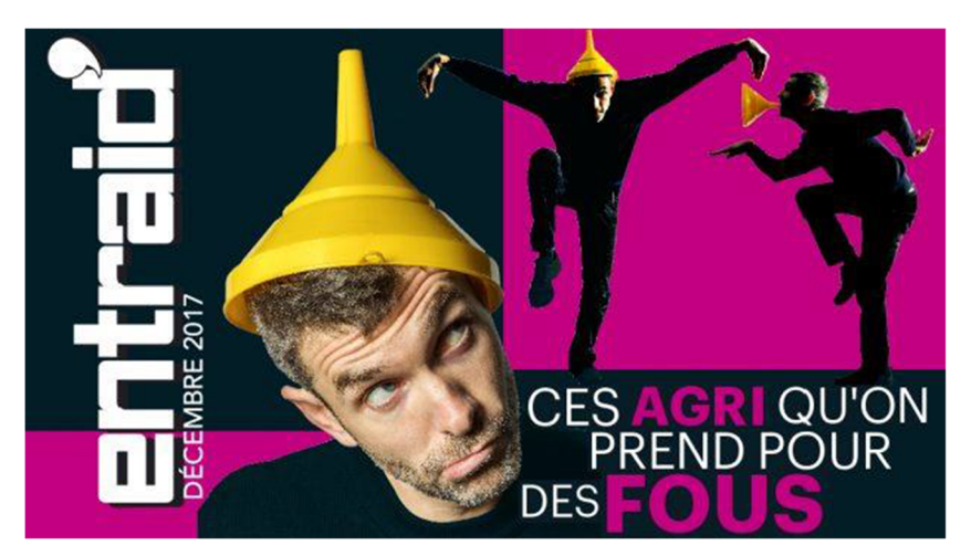
Figure 1 "Those farmers considered crazy". Excerpt from Entraid' journal no. 310, December 2017. "Unlike those who consider that going off the beaten track is insane, in December 2017, insanity inhabits us. Like those farmers considered crazy but who are spearheading progress in farming. Thirty years ago, they were the first ones to buy a milking robot, to join forces to work together, to embark on

Since the emergence of the movements for Farming System Research (Byerlee et al. 1982) and Comparative Agriculture (Cochet 2015), different ways of studying farmers' practices have been formalized (Landais et al. 1988; Ruthenberg 1971; Jiggins 2012). The best known include agronomic diagnosis (e.g. Doré et al. 1997), the modelling of farmers' reasonings (e.g., Girard and Hubert 1999; Mérot et al. 2008; Zhang et al. 2019), and agrarian diagnosis (Barral et al. 2012). These approaches generally apply to the study of populations of fields or farms within a micro-region: (i) to identify problems that need to be solved and deviations from recommended practices (e.g. Zandstra 1979), (ii) to