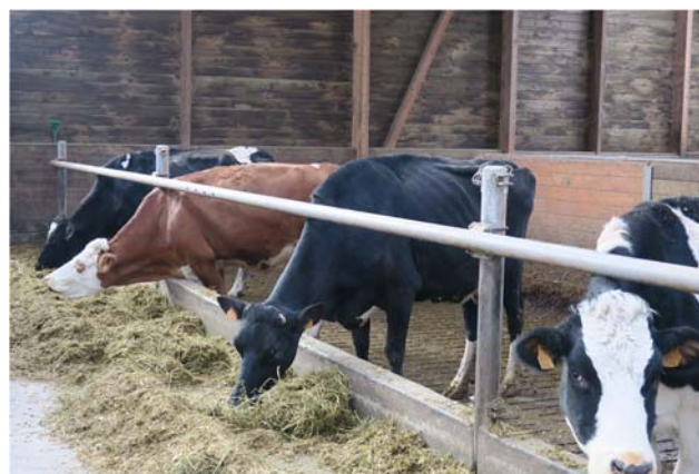
Fig. 1 Picture of a dairy herd in one of the surveyed farms taken during winter 2017–2018, at the end of the conversion to organic farming.

We adopted a mixed approach to select variables illustrating farmers' satisfaction and conversion strategies based on a literature review, participant observation, and exchanges with advisors and farmers in our study territory, the Aveyron Department in South-Western France. In 2015–2016, we did participant observation during three collective farm and factory visits, two organic farmer training sessions, four student interviews with actors in the local dairy sector, and three advice time on the conversion project one-on-one with the adviser and farmer. In 2016, we conducted interviews with the surveyed farmers focused on motivations for converting to organic farming (Bouttes et al. 2018a). In 2017, we organised two focus groups with local advisers and dairy farmers to discuss our choices regarding the studied variables. There was no consensus among farmers on the indicators and