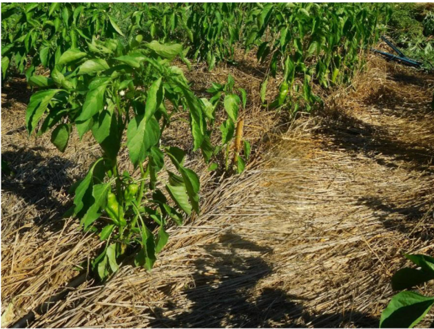
Fig. 1 Pepper plant transplanted into a narrow furrow created by the ILRC after flattening the ASCs in Spain. Author: Alejandro Pérez-Ferrer

and production (Mirsky et al. 2012; Carr et al. 2012; Canali et al. 2013; Frascioni et al. 2019). However, to the best of our knowledge, only one study has focused on the effect of RC management on weed species richness (Halde et al. 2015), and another one has discussed, but not tested, its influence on weed community composition (Ciaccia et al. 2016). It therefore appears that the currently available information does not yet show robust evidence of the effectiveness of ILRC for weed control and the effect of this management technique on weed species richness and community composition across different vegetable crops, soils, and climatic conditions in European organic vegetable systems.