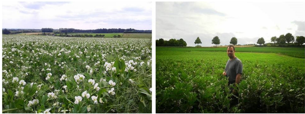
Fig. 1 Farmers' interest in grain legumes is high, but there is a huge gap of knowledge about these crops

farms with over 5 ha arable land; a total of 1373 farmers were contacted. The criterion to send the survey only to farmers who manage more than 5 ha guaranteed that part-time farmers are not overrepresented. To protect anonymity, the questionnaire was mailed by the “Service d’Economie Rural (SER)” of the Ministry of Agriculture, Viticulture and Consumer Protection (MA). A reminder was sent to the farmers in November 2012. The questionnaire was sent again 6 months after first distribution, in February 2013 (Dillman 1991).