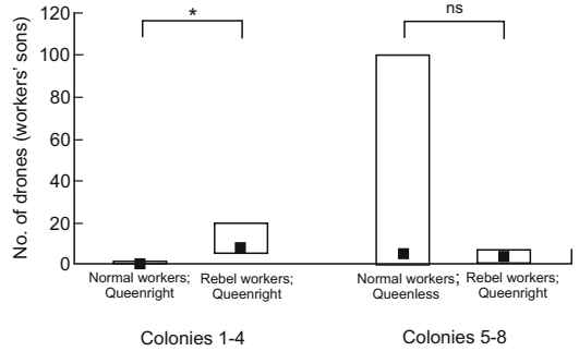
Figure 3. Number of workers' sons (median and quartiles) produced by subunits with rebel and normal workers. Stars indicate significant differences ( P < 0.05 ). ns indicates no significant difference ( P > 0.05 ).

and Visscher 1989), the latter of which includes all of the behaviours of workers or the queen that reduce the reproductive output of other workers, e.g. harassment of reproductive workers (Visscher and Dukas 1995; Monnin et al. 2002) and the selective removal of worker-laid eggs (Ratnieks and Visscher 1989). Until now, worker reproduction in the presence of the queen has been described only in A. m. capensis (Cape honeybee) living parasitically in A. m. scutellata colonies (Beekman and Oldroyd 2008; Beekman et al. 2009) and in anarchistic bees, which represent a rare mutant phenotype (Barron and Oldroyd 2001). Workers of A. m. capensis can lay unfertilized eggs that develop into females (via thelytoky) and can be reared as either workers or queens (Ruttner 1977), and this type of parthenogenesis is determined by a single recessive gene (Lattorff et al. 2005). Similarly, the anarchistic syndrome is also based on genetic components (Barron et al. 2001; Beekman and Oldroyd 2008), specifically, two independent mutations, and under natural conditions, anarchistic colonies are rare and are eliminated by natural selection (Beekman and Oldroyd 2008). However, these two examples are