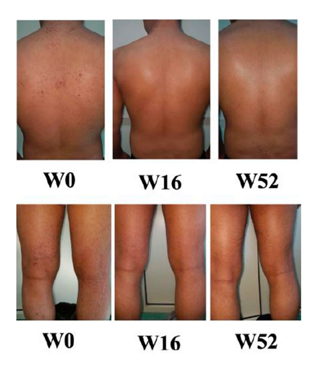
Fig. 2 Improvement of a patient from baseline to 16 and 52 weeks of treatment with dupilumab

while the CAFÉ and CHRONOS studies assessed the drug administered concomitantly with topical corticosteroids, at 16 and 52 weeks of treatment, respectively [3, 4]. Currently, data regarding its daily practice setting, real-word effectiveness and tolerability up to 52 weeks are limited [5–7].