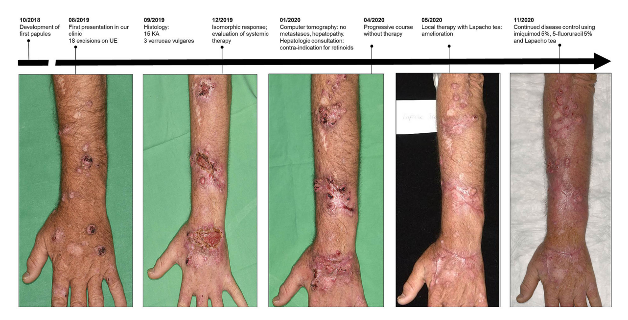
Fig. 1 Time line of clinical course covering 25 months showing the left arm. Upon first presentation to our department in August 2019, the patient showed several follicular papules and nodular lesions, some with a central horny plug. One month after surgical treatment of 18

lesions, the patient displayed an isomorphic response (Koebner phenomenon) within suture lines. The nodules further progressed without treatment; local therapy with lapacho tea dressings yielded amelioration. UE upper extremities, KA keratoacanthoma