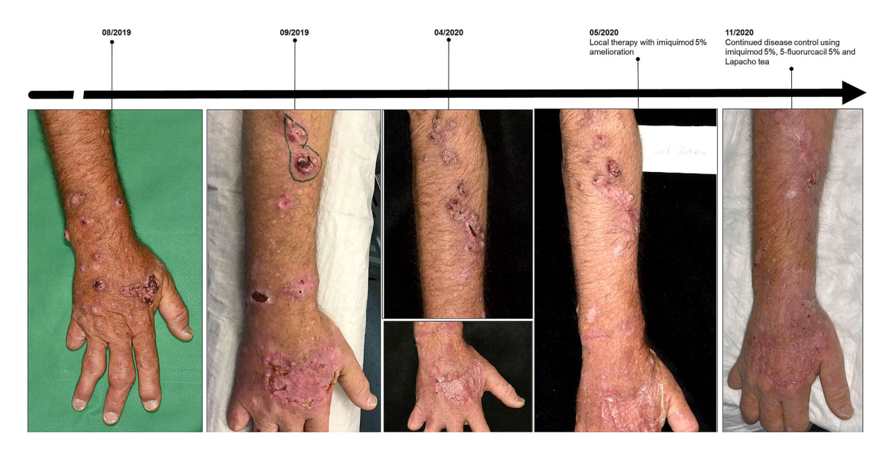
Fig. 2 Time line of clinical course covering 25 months showing the right arm. The lesions further progressed without treatment; local therapy with imiquimod 5% cream yielded amelioration

lesions, the patient displayed an isomorphic response (Koebner phenomenon) within suture lines. The nodules further progressed without treatment; local therapy with lapacho tea dressings yielded amelioration. UE upper extremities, KA keratoacanthoma