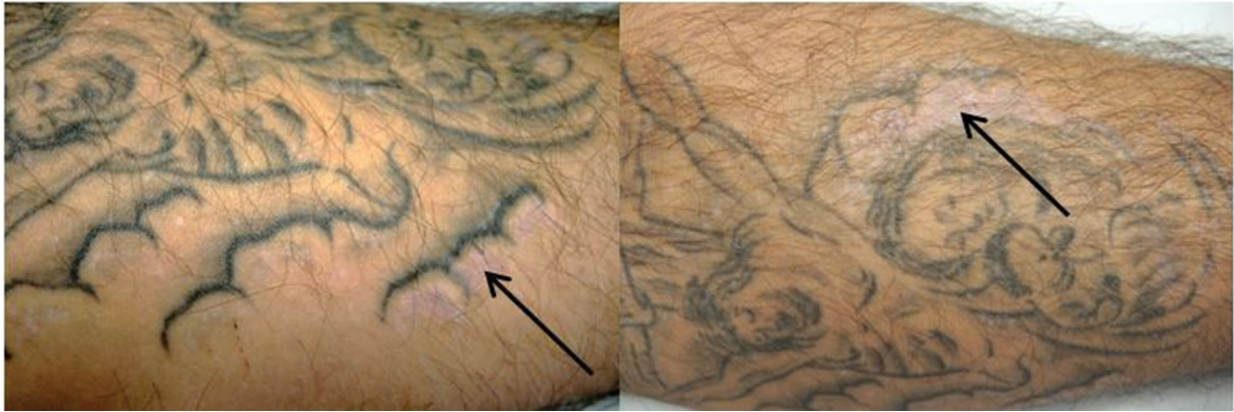
Fig. 1 Hypopigmented, shiny maculae within a tattoo on the left upper forearm

(Fig. 1). The role of \beta -HPV types in terms of skin carcinogenesis in the normal population is as yet unknown [5, 7–10, 13].