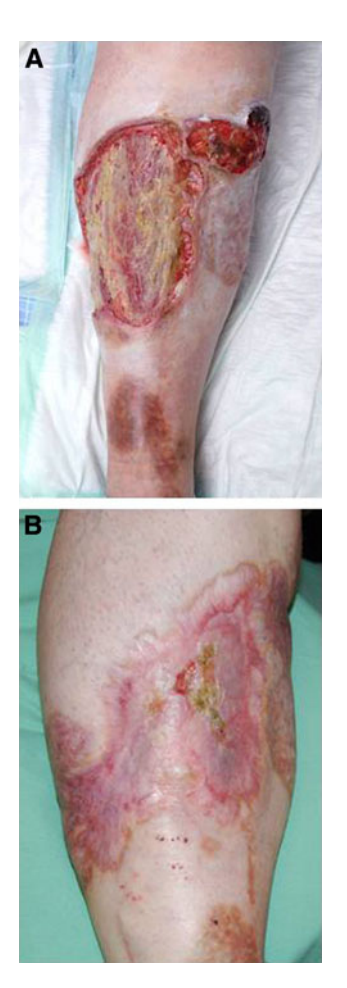
Fig. 1 Large pyoderma gangrenosum (PG) defect on the right lower leg after failure of several standard therapies and before treatment with adalimumab (a). PG almost healed after 64 weeks of treatment with adalimumab (b)

New therapeutic strategies take into account that patients with inflammatory bowel disease, which is frequently associated with PG, present increased levels of tumor necrosis factor- \alpha (TNF- \alpha ). Furthermore, PG itself seems to be associated with high serum levels of TNF- \alpha , resulting from an abnormal T-cell response in PG patients. Hence, several authors presumed that inhibition of TNF- \alpha could effectively treat PG [4–7]. In recent years, a growing rate of case reports about successful treatment of PG by the use of TNF- \alpha -inhibitors such as etanercept, infliximab, and adalimumab have been published.