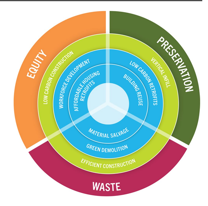
Fig. 2 Embodied carbon policy can build on existing priorities. This approach is rooted in demand reduction (blue bands) and can be enhanced with material substitution strategies (light green band). Building on waste, equity, and preservation policy can make embodied carbon a more mainstream concern

Heritage preservation has been a persistent interest for cities and neighborhood advocates for decades, if not centuries. Given this long history, the definition of heritage has expanded beyond nineteenth century stone edifices to encompass mid-century modern buildings and beyond (Tyler et al. 2018). Preservation extends beyond heritage conservation to adaptive reuse, renovation, retrofits, and even maintenance. All of these can contribute to a larger vision of sustaining culture and a sense of place through maintaining historic layers in the urban fabric, values which