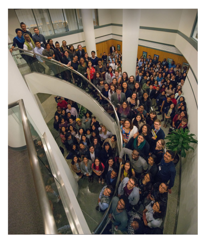
Image 1 Participants at the New Horizons in Conservation Conference gather for a photograph. The conference was held in Washington, D.C., from April 18–20, 2018.

So, while AESS executed one of its strategic goals—that of holding the conference in a racially diverse city—the conference had no obvious connections to the environmental studies departments in two well-known historically black colleges and universities (HBCUs) located in the host city. Washington, D.C.—a city that is 47% Black, 37% White, 11% Latinx, and 4% Asian (U.S. Census Bureau, 2017)—is home to Howard University and the University of the District of Columbia. Both of these HBCUs have environmental studies departments. Despite the fact that connecting to HBCUs is a strategic objective of AESS, that connection was missed at the last conference. Moreover, there are several professional associations and organizations that cater to people of color that are housed in Washington, D.C., that were not a part of the conference. Hence, without heightened awareness about the causes of lack of diversity and more intentional planning to enhance inclusivity, relatively few people of color in ESS will attend the annual gatherings. In the future, AESS should seek to strengthen collaborations with colleges, universities, professional associations, diversity pathway programs, and environmental institutions that serve primarily people of color in the