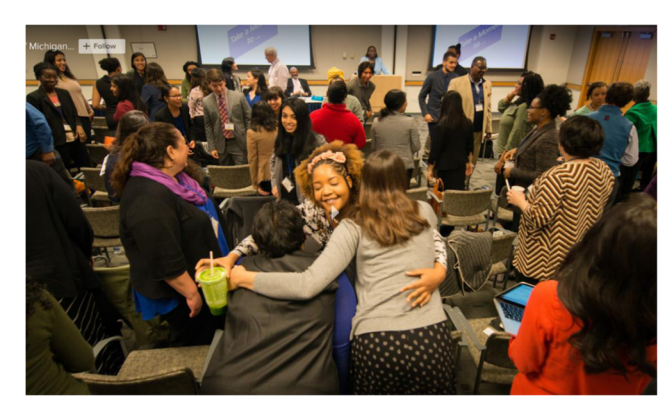
Image 2 Participants at the New Horizons in Conservation Conference take time to greet each other. The conference was held in Washington, D.C., from April 18–20, 2018.