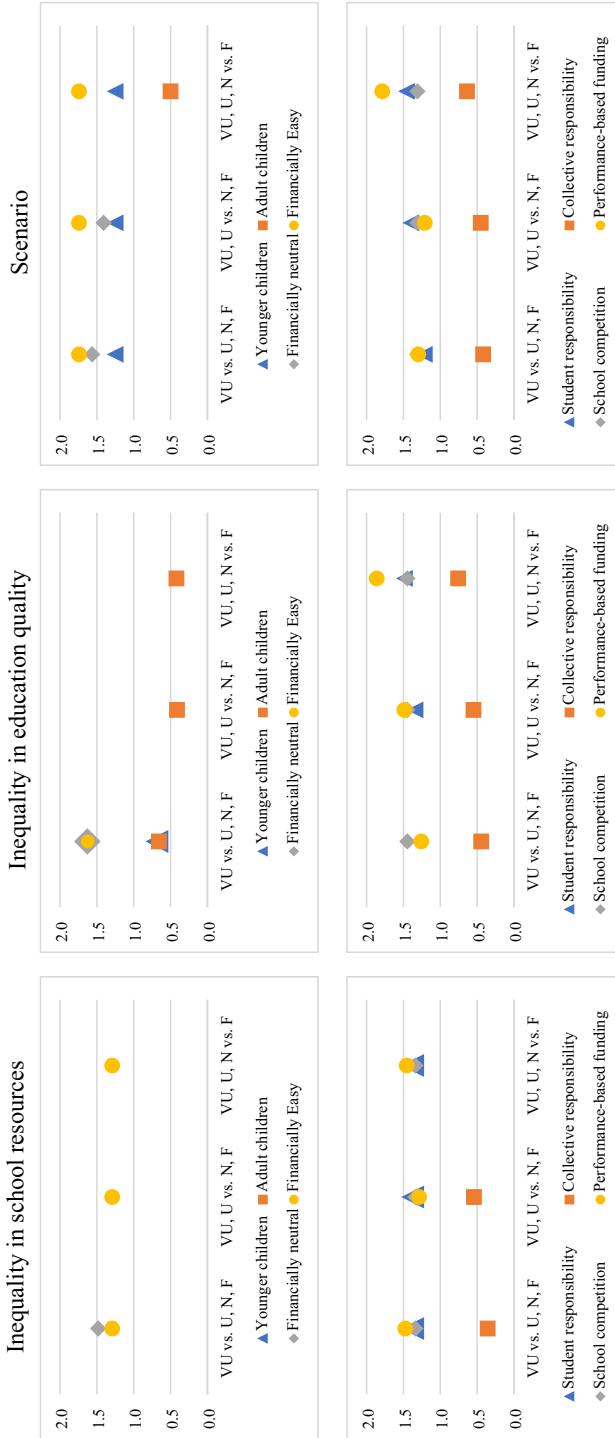
Fig. 2 Odds ratios from partial proportional ordinal regression predicting fairness perceptions of educational inequality. N=1968 . VU very unfair, U unfair, N neither fair nor unfair, F fair or very fair. Reference groups for categorical variables are ‘no children’ and ‘financially difficult’. Only statistically significantly different odds ratios are presented