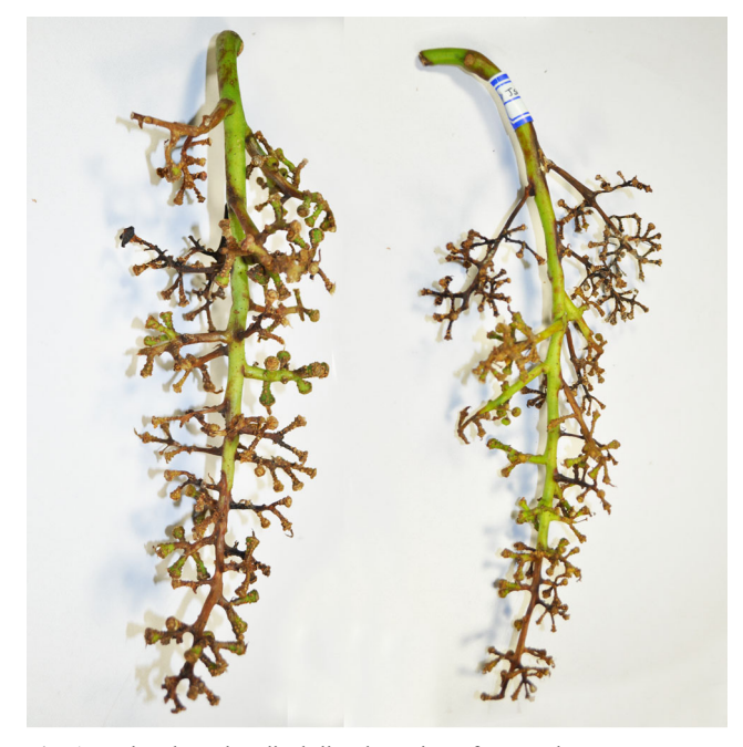
Fig. 1 Peduncle and pedicel discolouration of grape clusters

obtained from the culture plates were mounted in microscopic slides and the dimensions of 40 conidia were measured with Nikon DS-RiI digital camera connected to a Nikon NIS-Elements F3.0 microscope.