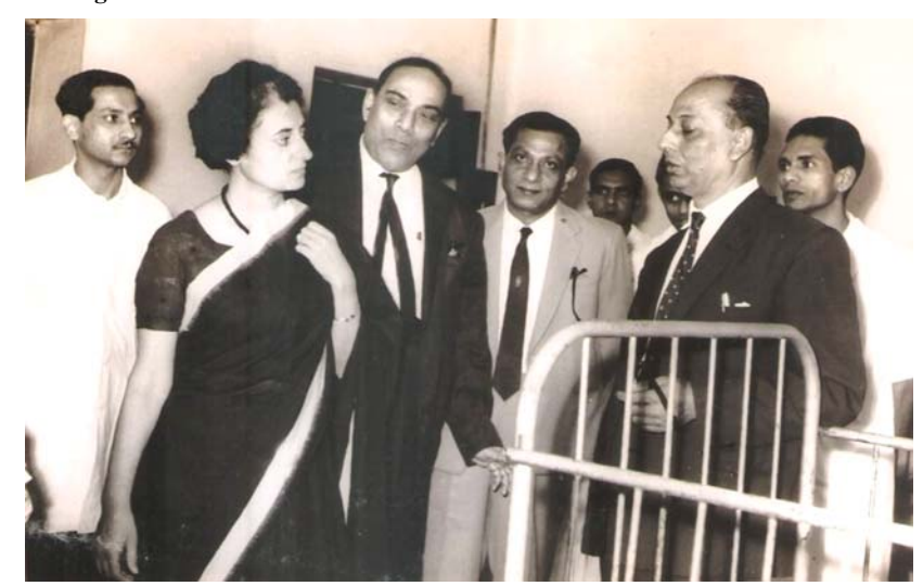
Fig. 5 Prime Minister Mrs. Indira Gandhi visiting ICH in 1965.