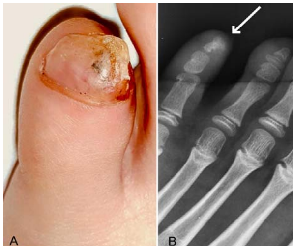
Fig. 1 Dupuytren's subungual exostosis; (a) mass under the nail of fifth toe causing onycholysis, and (b) radiograph showing dorsomedial exostosis (arrow).

Differential diagnosis includes viral warts, pyogenic granuloma and osteochondroma. Papillomavirus periungual warts are firm, keratotic papules which are located around the nail. They can be painful and cause onycholysis and hyperkeratosis. Pyogenic granuloma, an acquired benign vascular tumor, appears as a rapidly growing erythematous, soft, friable nodule with erosive surface and tendency to bleed under pressure, commonly located on fingers and toes but also in the head and neck region and oral mucosa. Osteochondroma is clinically similar to Dupuytren's SE but radiographically and histologically different – unlike the latter, in the majority of the cases, osteochondroma has continuity with the underlying bone and is covered by hyaline cartilage.