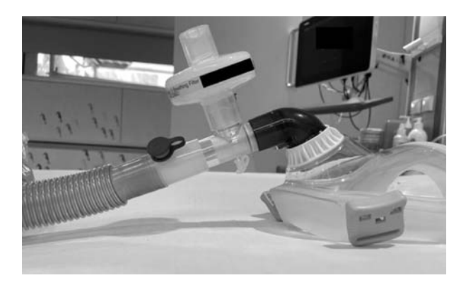
Fig. 3 Use of expiratory filter in single limb NIV tubing (use a non-vented mask).

NIV - non-invasive ventilation; HFNC - high flow nasal cannula; HCW-healthcare worker; PEEP - peak end-expiratory pressure.