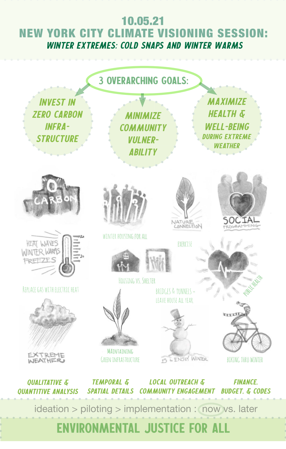
Fig. 2 Winter extremes scenario visualization by Artist Ann Armstrong for the NYC Adaptation Scenarios (Cook et al. 2022)

sustainability and resilience, or the source of the largest challenges we are facing (Artmann et al. 2019; Seto et al. 2012). An example of expanded urban thinking is the conceptual framework Jamshed et al. (2020) presented on how rural–urban dynamics are linked to flooding