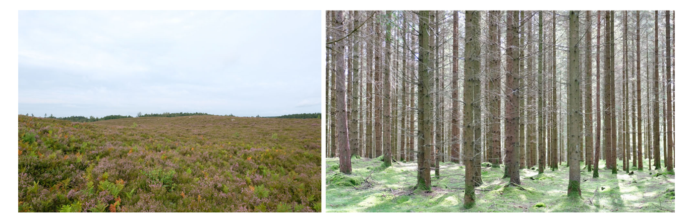
Fig. 2 Legacies of past land management: two geographically proximate Swedish landscapes, one heathland. (left) and one forest (right) The difference in carbon storage in these two landscapes with very similar biogeophysical conditions is a legacy of past management.

RI communities are increasingly recognising the benefits of co-location for improved understanding of the Earth system. Although ICOS Ecosystem Sites focus primarily on flux measurements relevant for ecosystem carbon cycling, these sites also make observations relevant for understanding biophysical and socio-ecological processes that influence GHG fluxes (Saunders et al. 2018). These ancillary observations are collected using SOPs and can (in principle) be translated for comparability with LLOs or