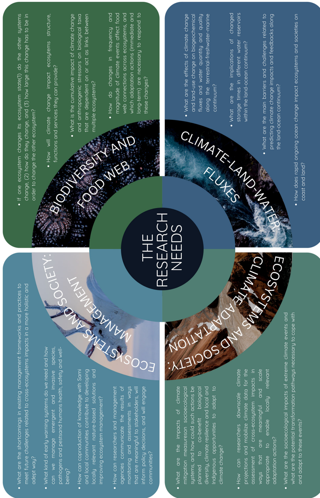
Fig. 2 The 15 research needs identified during the horizon scan