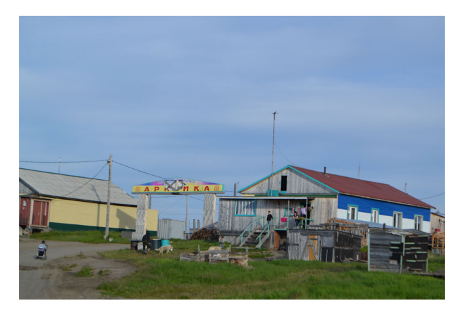
Fig. 2 The sign "Arktika" in the center of Bykovskiy refers to the community-shaping fishing cooperative still in existence.

Post-Soviet socio-economic and political transformations have been affecting trajectories of development of Russia's Arctic regions and lives of their permanent residents in