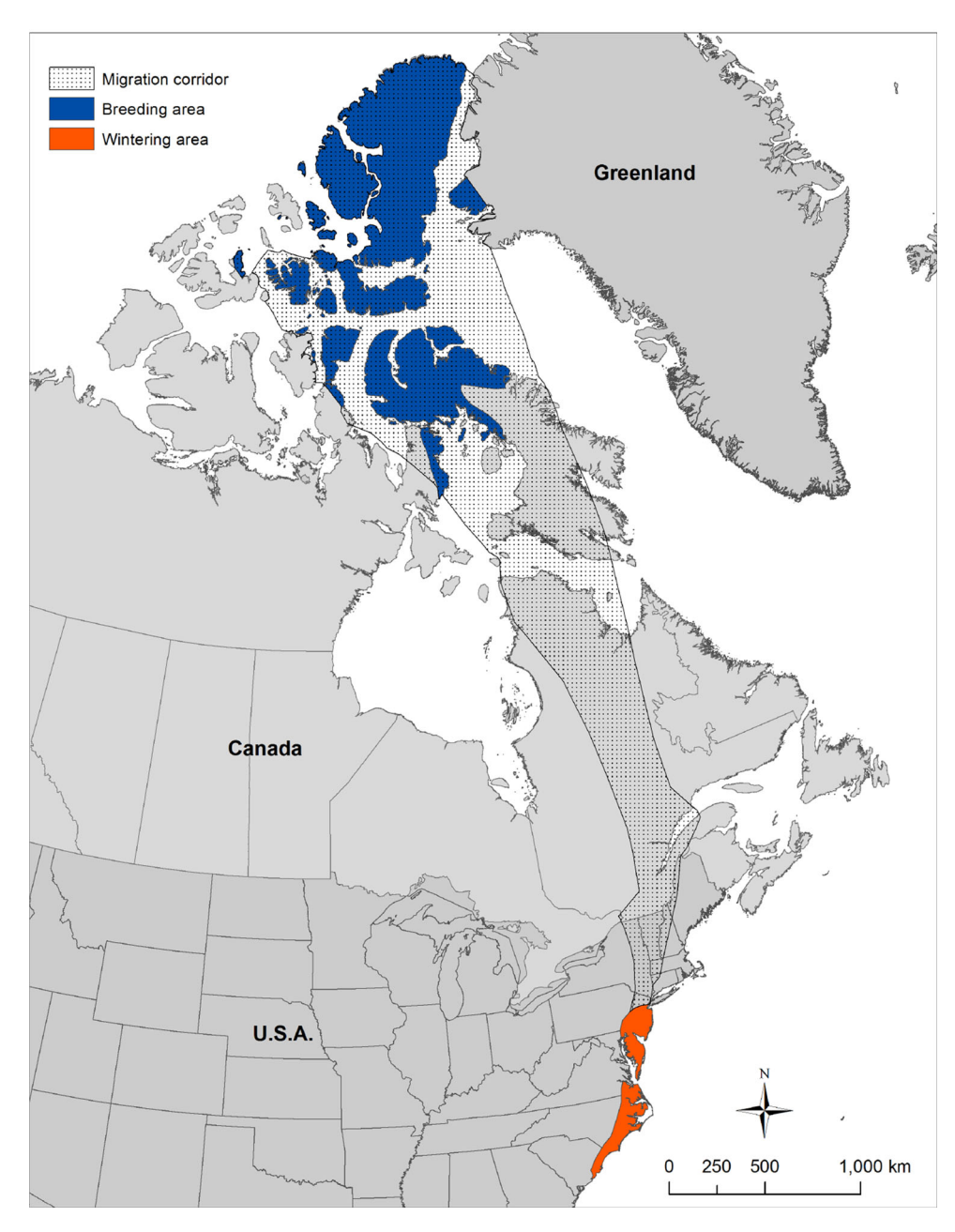
Fig. 1 Range map of greater snow geese in North America

major challenges encountered and lessons learned throughout the entire process.