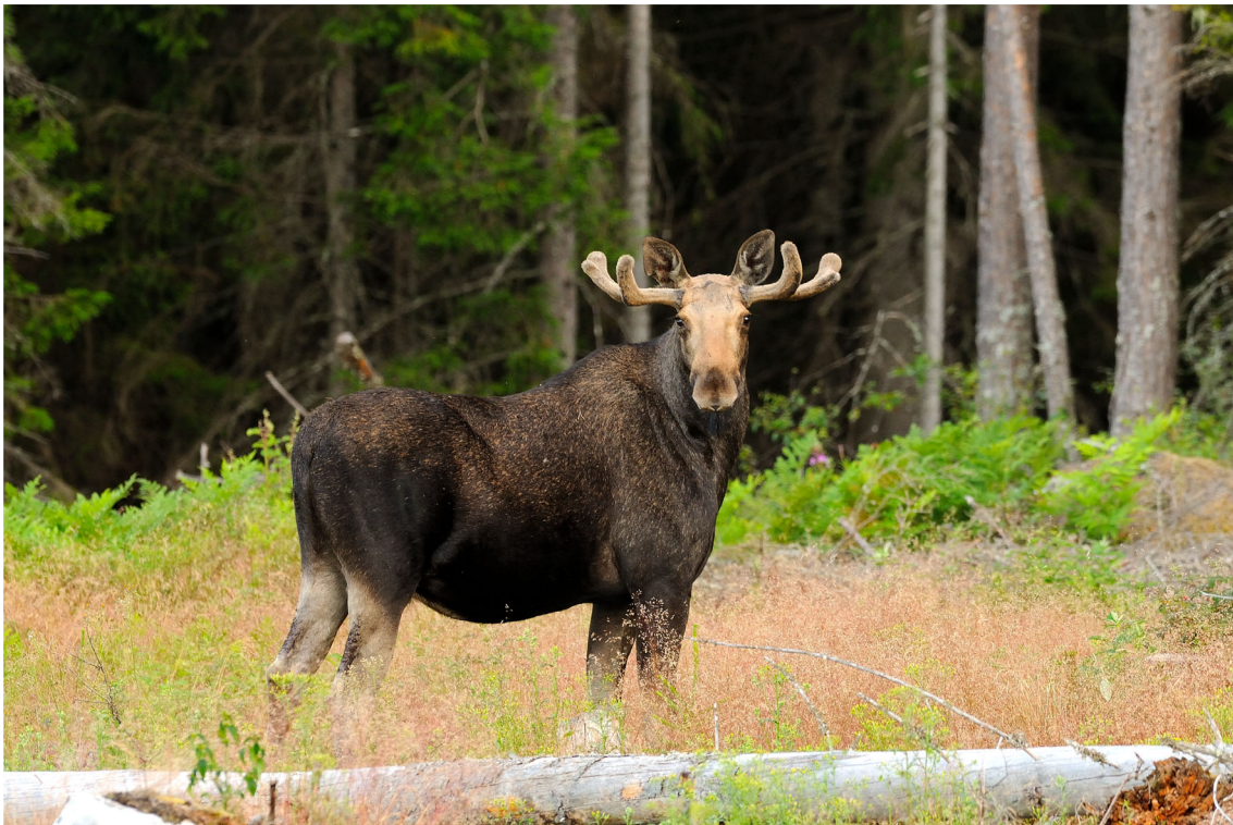
Fig. 1 A male moose in one of Sweden's hunting districts. Moose hunting is an important source of revenue and meat supply to landowners and has also a high recreational value.

and efforts to use a tool that was created by researchers for researchers.