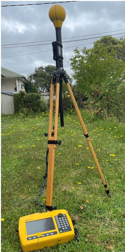
Fig. 3 SRM-3006.™ spectrum analyser used in a spot RF-EMF exposure assessment

system attached to a car-roof to assess mobile phone base station exposures (900 MHz and 1800 MHz) over a large area [55]. This driving-mode RF-EMF monitoring system claimed that it provides reliable RF-EMF measurement data which are comparable to those given by exposure modelling or the body worn exposimeter. Newer versions of RFeye node systems are available [54] and included in Table 2.