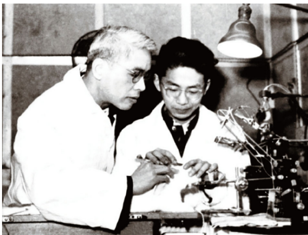
Figure 4. Te-Pei Feng (left) instructed graduate students to conduct anatomy experiments on the rabbit brain.

From 1936 to 1941, Feng published at least 26 papers in the Chinese Journal of Physiology . However, because of the Anti-Japanese War and the Pacific War, PUMC was forced to close and Feng had to leave in 1941, which interrupted his research. Among the crucial 26 papers, some of which are still cited today, is Feng's pioneering work in the theory of chemical transmission at the neuromuscular junction, which