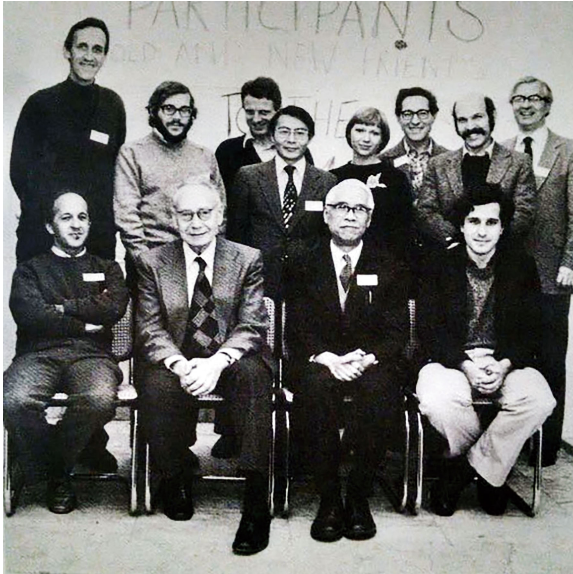
Figure 8. In the 1980s, Te-Pei Feng (front row, third from the left) and Bernard Katz (front row, second from the left) attended international conferences.