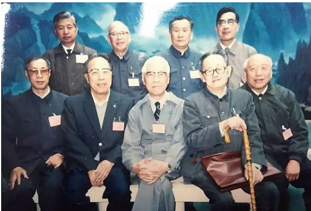
Figure 6. In 1992, Te-Pei Feng (front row, in the middle) joined the 6th general assembly of the Chinese academy of sciences.

neurophysiology research capacity with him (Fig. 7) (Qian, 1981; Zhang & Le, 2011). Chang came back to China in 1956 and set up the central nervous system research laboratory a few years later. In 1958, Feng joined the delegation of the Chinese Academy of Sciences to discuss the corporation with the Soviet Academy of Sciences. After returning from the USSR, Feng set up and directed the Qingdao working group, after which the first Chinese Marine Animal