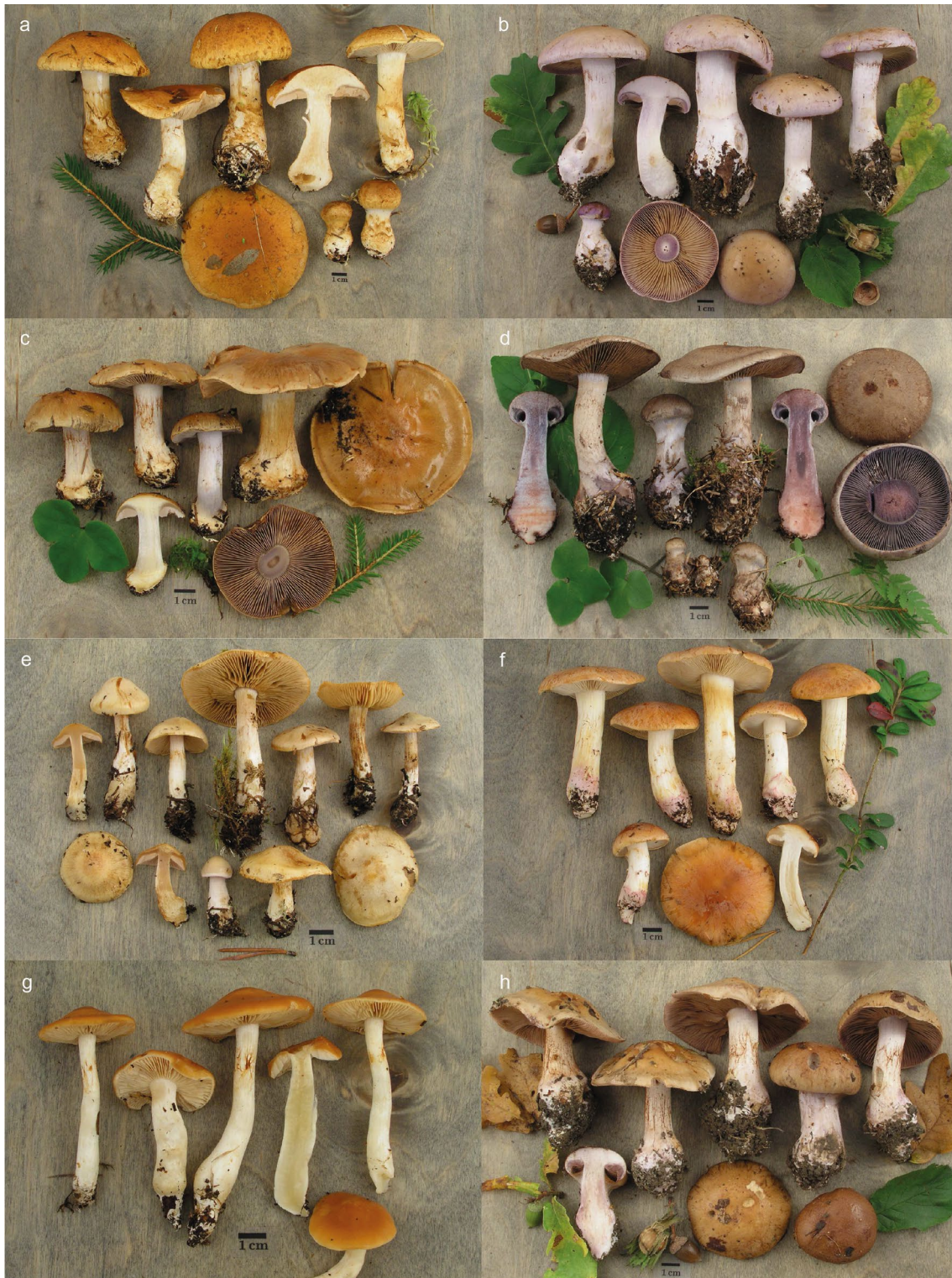
Fig. 5 Photos of the representatives of genera Phlegmacium and Thaxterogaster . A Phlegmacium subgen. Phlegmacium , P. saginum TN 05-232 (H), B P. subgen. Phlegmacium , P. largum TN 08-060 (H), C P. subgen. Bulbopodium , P. olivaceodionysae TN 06-311 (H), D P. subgen. Cyanicium , P. violaceorubens TN 07-062 (H), E T. sect.

Lustrati , T. leucophanes TN 05-161 (H), F T. subgen. Variiegati , T. variegatus TN 05-182 (H), G T. sect. Vibratiles , T. sp TN 05-210 (H), H T. subgen. Scauri , T. subpurpurascens TN 08-059 (H).