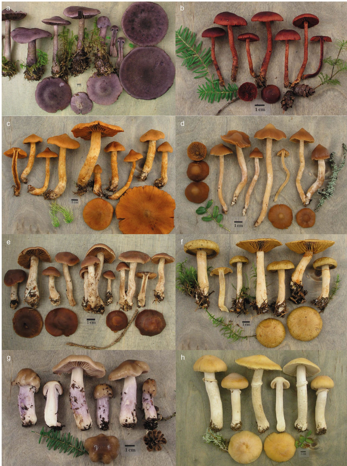
Fig. 3 Photos of the representatives of genus Cortinarius . A. C. subgen. Cortinarius , C. harynicus TN 04-525 (H), B. C. subgen. Dermocybe , C. neosanguineus TN 09-130 (H), C. subgen. Orellani , C. rubellus TN 05-024 (H), D. C. subgen. Iodolentes , C. mammillatus

TN 06-249, E. C. subgen. Telamonia, C. badiolaevis TN 04-960 (H), F. C. sect. Subtorti, C. subtortus TN 05-021 (H), G. C. subgen. Myxaciium, C. seidliae TN09-063 (H), and H. C. subgen. Paramyxaciium, C. caperatus TN 06-149 (H).