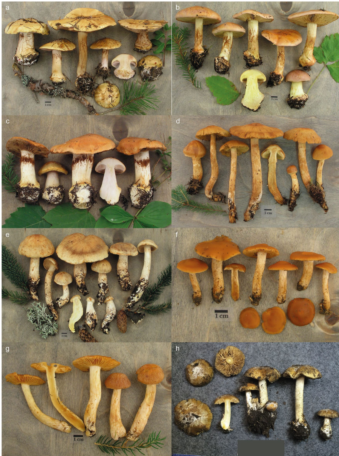
Fig. 4 Photos of the representatives of Cortinariaceae . A Calonarius subgen. Calochroi , C. metarius TN 06-268 (H), B C. subgen. Calonarius , C. odorifer TN 05-138 (H), C C. subgen. Fulvi , C. sp. TN 11-128 (H), D Aureonarius limonius , TN 07-282 (H), E Cystinarius

rubiginosus TN 12-223 (H), F Hygronarius renidens TN 05-197 (H), G Mystinarius lustrabilis TN 05-218 (H), H . Volvanarius olivaceovaginatus K235015.