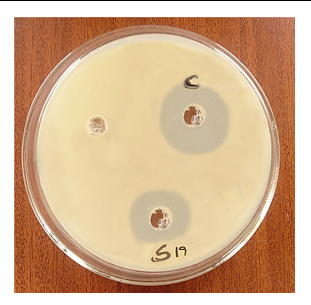
Fig. 2 Antibacterial activity of EPS nanoparticles in cream against sample 19 (S19) at 39 \mu g/mL concentration [Control (C)—tetracycline]; (no name—chitosan + cream)

The antibacterial activity of EPS nanoparticles against S19 strain was performed by checking varying concentrations. The EPS nanoparticles were effective against P. acnes at a concentration of 39 µg/mL, and the zone of inhibition was measured as 18 mm (Fig. 2). Cream with and without chitosan did not show any activity against the organism. After 2 weeks, the EPS nanoparticles were found to be quite stable in a cream emulsion. It was observed that the zone diameter measured for the activity of EPS nanoparticles emulsified in cream was more or less same as that of solitary EPS nanoparticles (18 and 18.5 mm against S19, respectively). This proves that EPS nanoparticles are stable in emulsions. The antibiotic tetracycline was also effective against the organism, with a zone diameter of 24 mm (Fig. 2). However, literature suggests that the organism has shown resistance to such antibiotics (Simonart et al. 2008; Andriessen and Lynde 2014). A novel