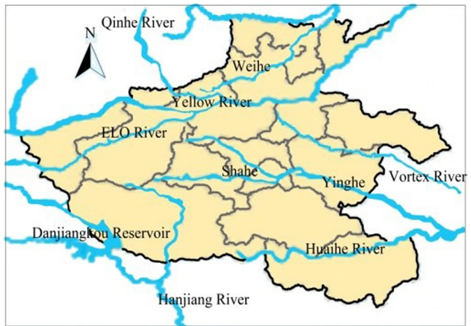
Fig. 2 Distribution of major river systems in Henan Province

Province is uneven, and the precipitation is mainly concentrated from June to September. The distribution of water resources shows that it is larger in the south than that in the north, and it is larger in the mountain area than that in the plain. With the rapid development of local economy and the growth of population, the water demand for industrial, agricultural and domestic sectors is increasing, which intensifies the carrying burden of water resources. Although a lot of scholars have carried out a large number of related studies on the water resources carrying capacity in Henan Province, the algorithms are simple and the evaluation indexes are scattered; it is difficult to meet the requirements of systematic evaluation on water resources carrying capacity. Therefore, it is of great importance to use the combined weight method to analyze the grade of water resources carrying capacity in Henan Province.